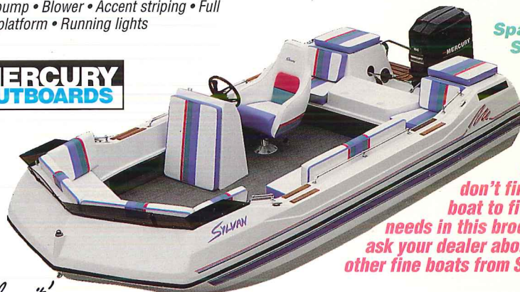
15' Space Ship

If you don't find the boat to fit your needs in this brochure, ask your dealer about the other fine boats from Sylvan