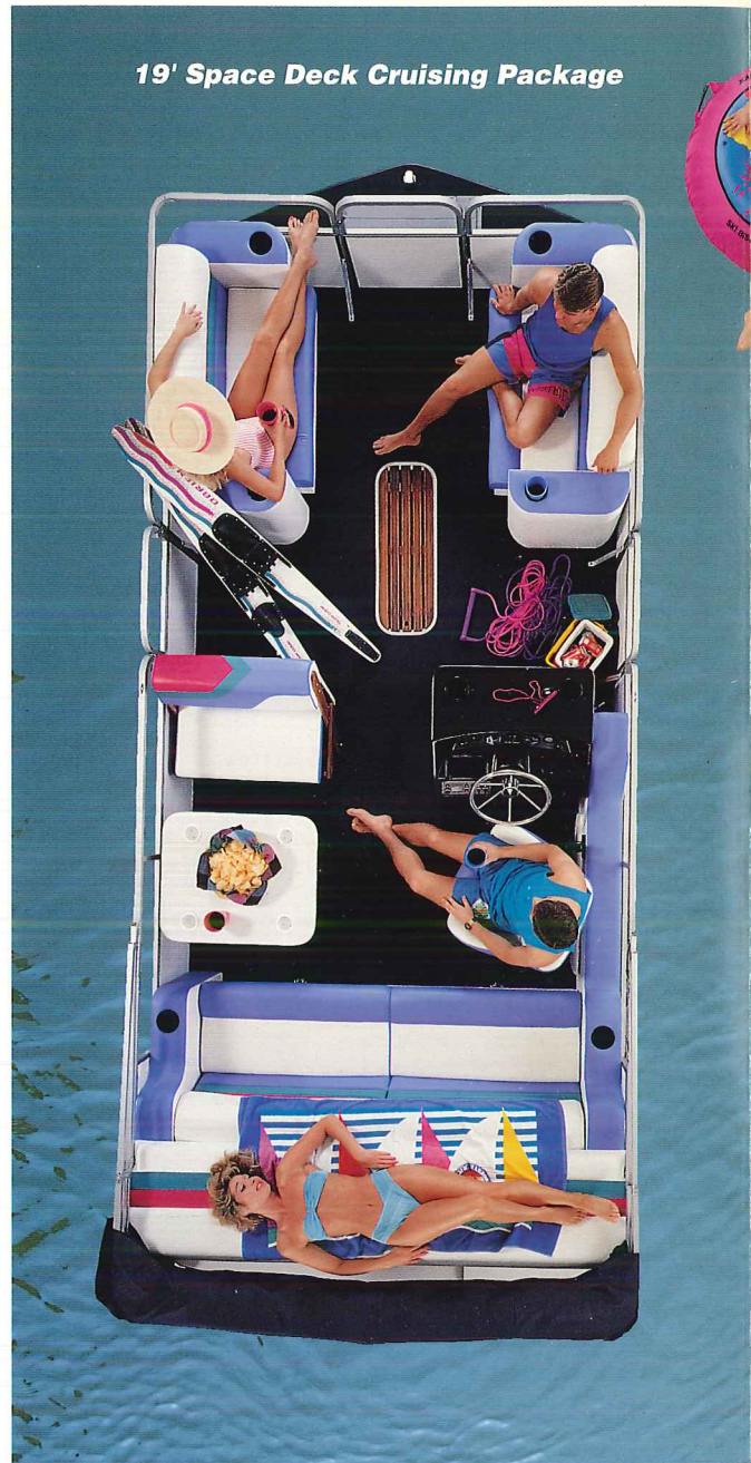
19' Space Deck Cruising Package

two removable bass seats and a flip-back storage box. And it's all highlighted by bold accent striping and vibrant, eye-catching colors.