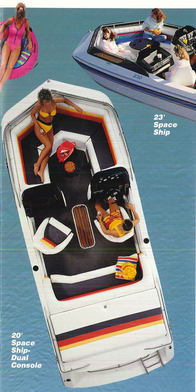
23' Space Ship