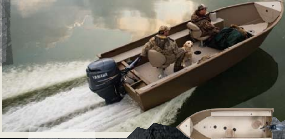
180 Freedom Tiller [ALSO AVAILABLE IN SIDE CONSOLE CONFIGURATION]