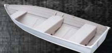
12' Sea Breeze