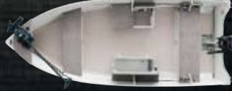
14' Super Snapper [SHOWN WITH OPTIONAL TROLLING MOTOR]