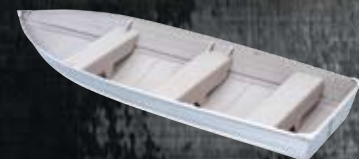
14' Sea Breeze