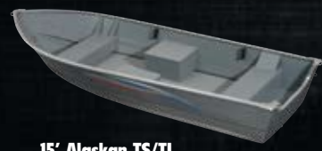
15' Alaskan TS/TL Split Seat DLX