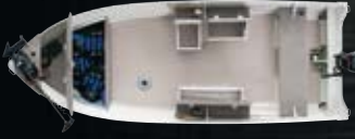
16' Super Snapper [SHOWN WITH OPTIONAL TROLLING MOTOR]