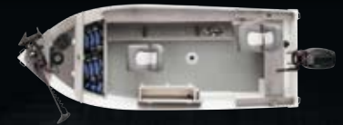
140 Sport Troller [SHOWN WITH OPTIONAL TROLLING MOTOR]