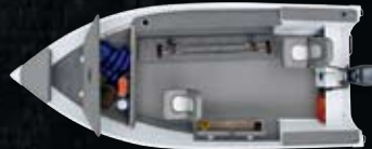
168 Sport Troller