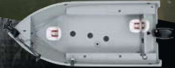
160 Freedom Tiller [SHOWN WITH OPTIONAL TROLLING MOTOR. ALSO AVAILABLE IN SIDE CONSOLE CONFIGURATION]