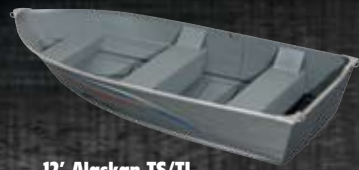
12' Alaskan TS/TL