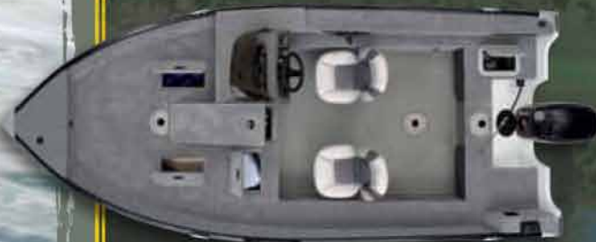
+ 1600 SC