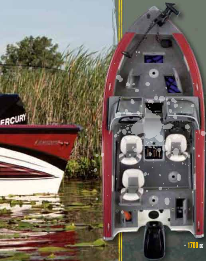
+ 1700 DC