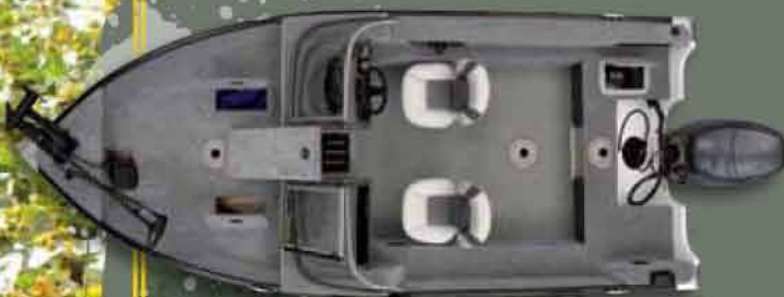
+ 1600 DC