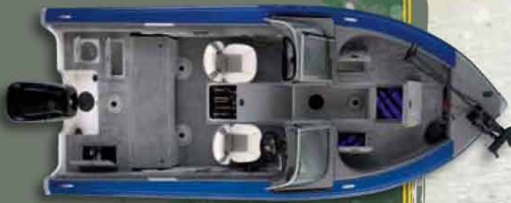
+ 1800 DC