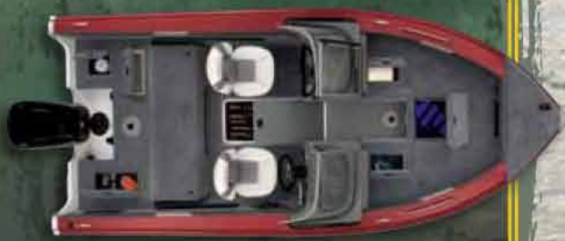
+ 1700 DC

All boats using OBs greater than 125 H.P. should have dual or hydraulic steering. Some models shown with optional equipment, including snap-in carpet, trolling motor and graph.